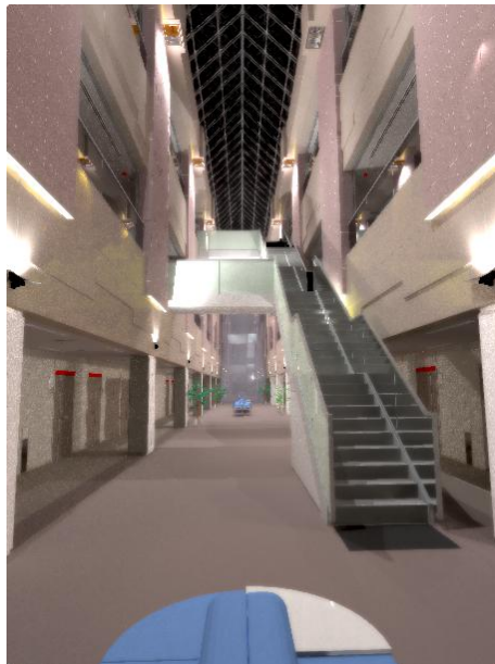
Figure 4.2: Scene "Aizu Atrium" as rendered by WP07 renderer (tonemapped for printing).