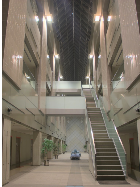
Figure 4.1: Scene "Aizu Atrium" as taken HDR photograph (tonemapped for printing).

However, the overall impression of the Atrium scene as rendered by WP07 renderer is preserved. This was also confirmed by several human subjects, although the match cannot be perfect due to the inconsistencies of the digital model and the real scene.