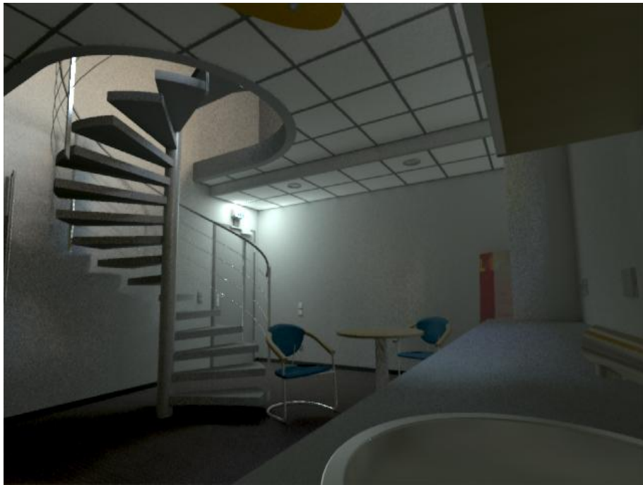
Figure 3.4: Viewpoint II: Scene "ICIDO office" as rendered by WP07 renderer (tonemapped for printing).