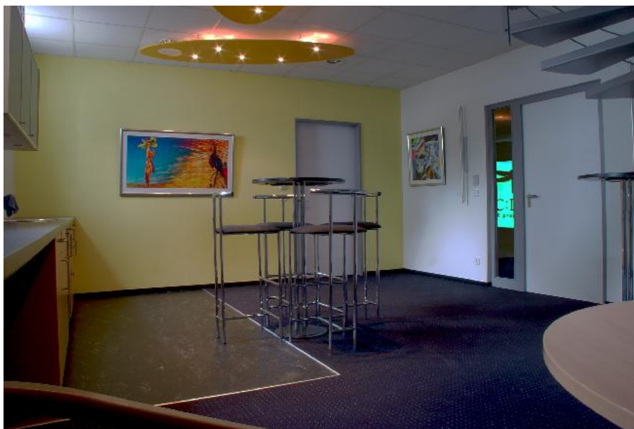
Figure 3.1: Viewpoint I: Scene "ICIDO office" as taken HDR photograph (tonemapped for printing).

However, the human subjects have agreed that overall mood of the scene was preserved in the rendered images. The similar problems we have encountered were reported by similar studies such as [Pell01], [Drago01], [Ubb98], and [Eissa01].