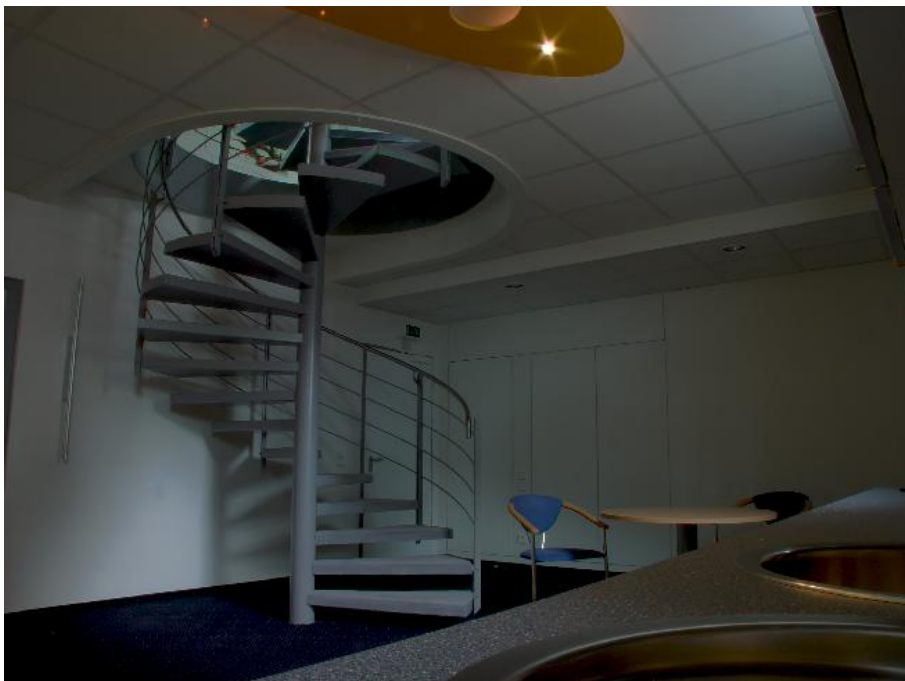
Figure 3.3: Viewpoint II: Scene "ICIDO office" as taken HDR photograph (tonemapped for printing).