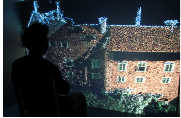
Figure 3: User flying through reconstruction space in CAVE.

The final step in our research will be a distributed user driven 3D reconstruction. Three categories of problems have to be solved. Firstly, direct application of existing solutions: Scene recalibration thanks to new photographs, what is no problem in our framework. Secondly, separation of user interaction from the reconstruction core: This would enable us to have multiple users, possibly using devices without much processing power, providing inputs to the reconstruction process simultaneously. The reconstruction process itself would then run on dedicated server, providing higher performance and synchronization among users. Thirdly, user interaction in immersive environment: Allowing users to modify the reconstruction directly in an immersive environment would introduce more natural interface to the reconstruction process, but it also brings new challenges for the user interface. For this reason, we intend extending protocol actions by additional functionality: Synchronization of input sets of pho-