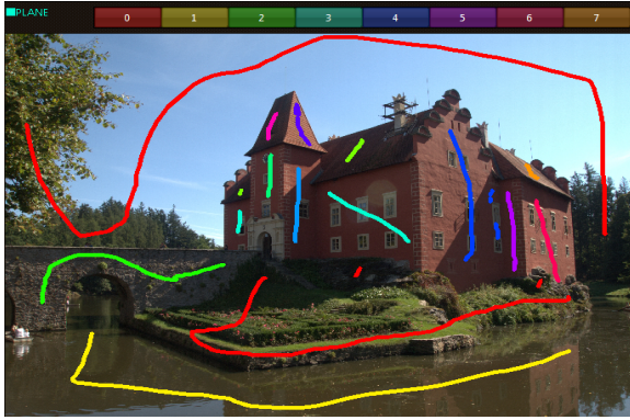
Figure 1: Sketch based segmentation interface.