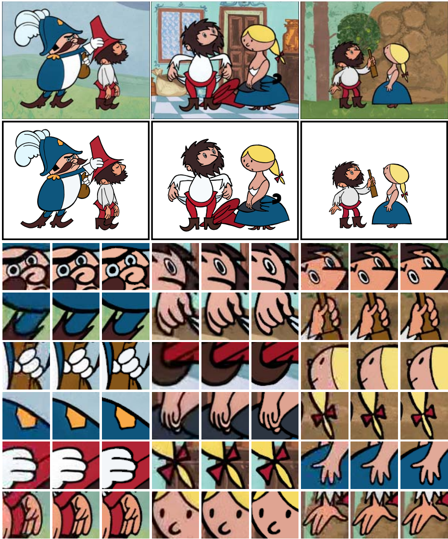
Fig. 2. Still image results – in each column see: the original image (top), vectorization of the foreground layer (middle), and detail views of different compression techniques (bottom). Small nested columns: detail views of DivX with comparable storage requirements (left), the original image (middle), and the output of our codec (right). In the vectorization of the foreground layer see misclassified foreground regions (e.g. small region between general’s boot and leg). They are not disturbing during the playback while the background layer is homogeneous at the same position.