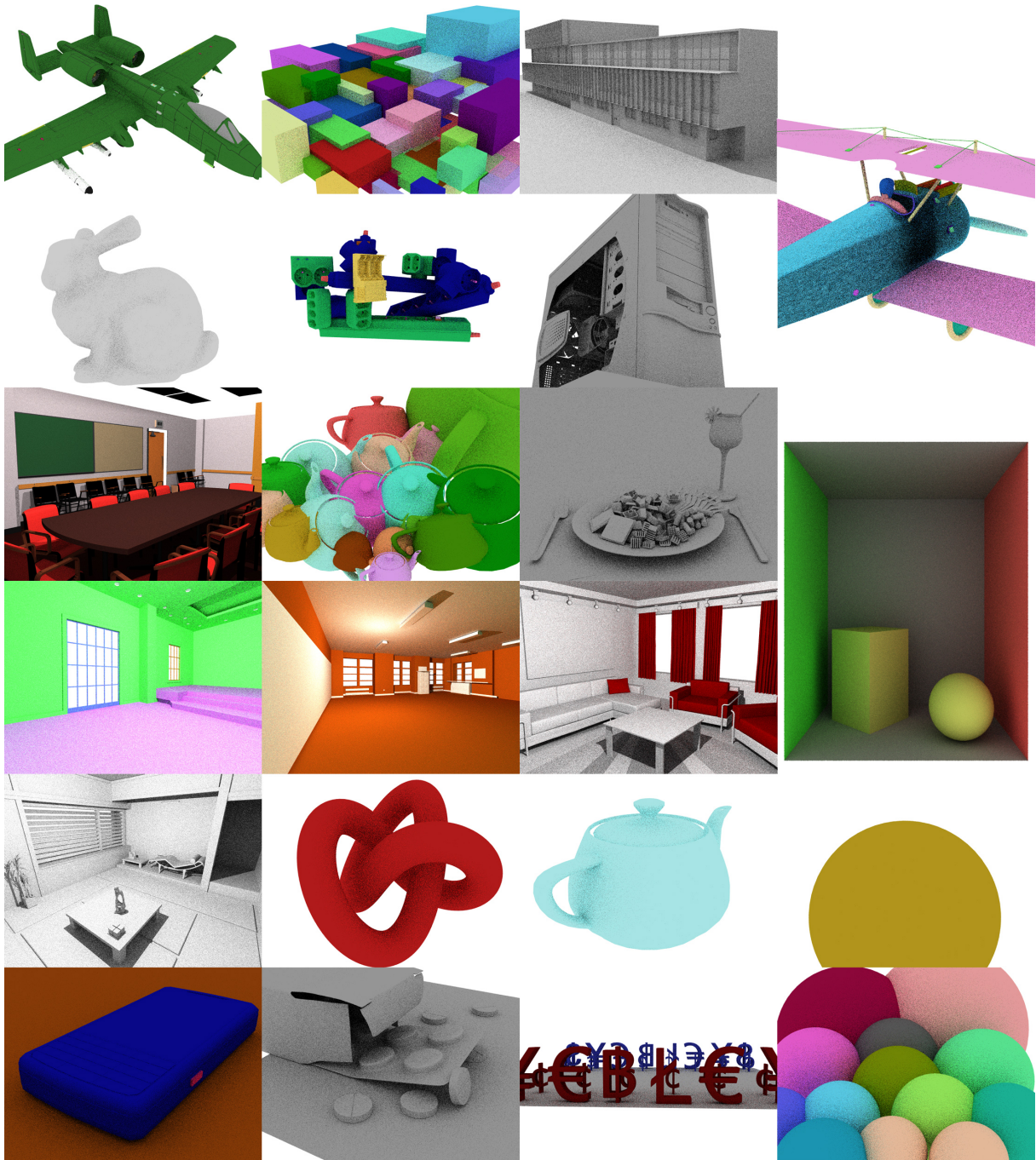
Figure 3: All used test scenes. There are multiple scenes with the same model which differ only in a polygon count. Only one picture for each such group is shown. Scenes from the top-left are: a10, boxes, building, camel, bunny, sockets, case, conference, teapots, hunger, cornell, interior-3, interior-dance, interior-deloux, interior-japan, knot, teapot, sphere, phone, pills, chess, spheres.

in any hardware platform and any implementation of ray tracing that uses uniform grid and hierarchical data structure. We show that the number of rays that gives the critical point for the same performance of grids and hierarchical data structure can be well estimated with only a low number of scenes.